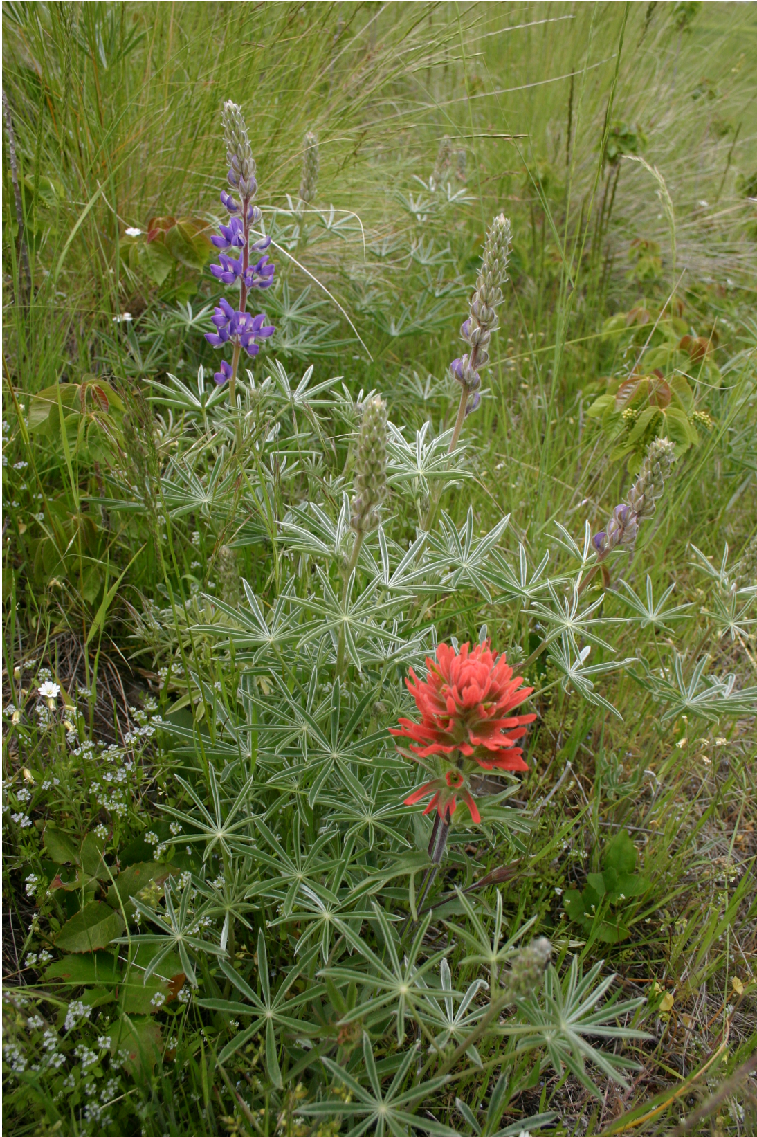
Figure 2. Seed from many prairie grasses and flowers can be easily gathered.