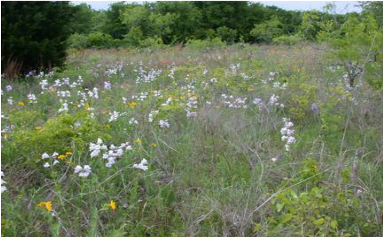
Figure 3. A native chalk prairie remnant at Granger Lake, Texas shows Beardtongue ( Penstemon cobaea ) among the diversity of grasses and perennial flowers (photo courtesy of C. O. Martin).

Prairie restoration efforts are under way at Granger Lake in the Fort Worth District (Figure 3). At Granger Lake, the project staff, with assistance from the Texas Parks and Wildlife Department, Texas Soil and Water Conservation Board, and the Native Prairie Association of Texas, manages a gene bank and prairie replication sites. Established in 1991, the gene bank hosts a collection of genetic material from relic prairie plant species, which are preserved for future environmental and educational uses (Horky 1998). Granger Lake, which has the best collection of Central Texas grass and flower genotypes in the area, started with 64 parent plants and now has hundreds planted over a 4-acre area. Granger Lake has also replicated a 110-acre prairie planted with an array of grasses and wildflowers to show visitors how the prairie in this area appeared historically. Despite its limited size, a variety of native grasses and prairie wildflowers provide year-round color and give visitors a glimpse at the beauty the prairie offers.