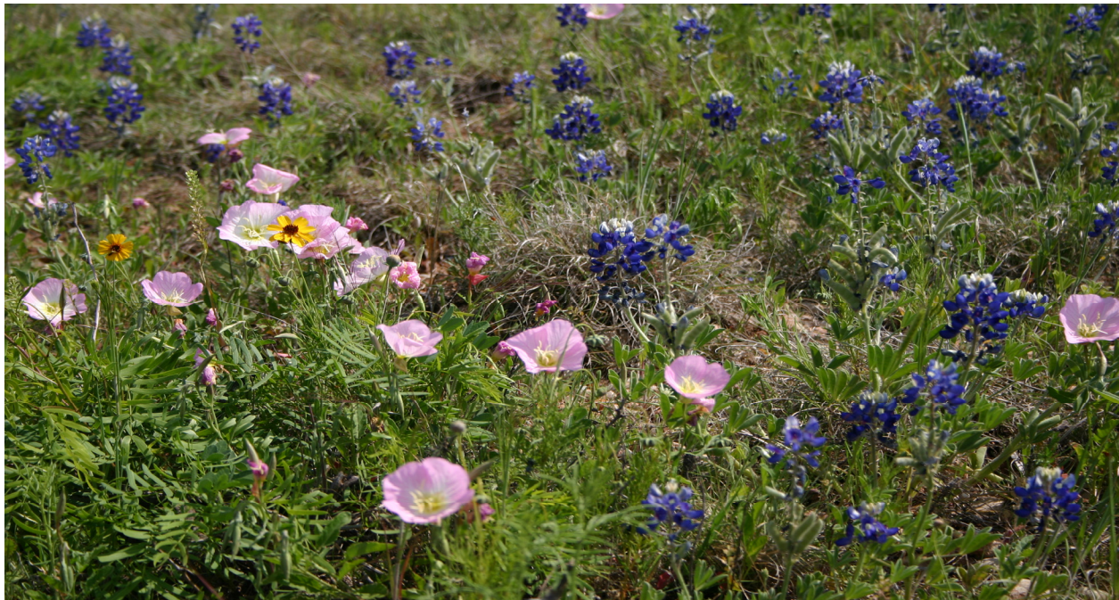
Figure 1. Pink Evening Primrose ( Oenothera speciosa ) and Texas Bluebonnets ( Lupinus texensis ) in a Texas prairie.

PURPOSE: This technical note identifies and describes sources for seeds and plant materials that can be used for prairie restoration and management efforts on Corps of Engineers project lands. This document is a product of the Ecosystem Management and Restoration Research Program (EMRRP) work unit titled “Prairie/Grassland Ecosystems on Corps Projects.” Many Corps of Engineers projects contain substantial grassland acreage (Figure 1), and there is considerable potential for Corps districts to improve prairie communities on project lands throughout the United States (Martin and Peloquin 2005). Prairies are important to watershed protection because they fulfill multiple functions on a landscape scale including their role as a buffer controlling sediment and non-point source pollution from entering waterways, providing erosion control, nutrient cycling, water purification, restoring aquatic habitats, improving wildlife habitat, and providing protection for rare plant and animal species. Additionally, native prairies function as a stable plant community and qualify as meeting the Corps’ “Sustainable Lands Performance Measure,” now tracked by the Operations and Maintenance Business Information Link (OMBIL) and incorporated in the Environmental-Stewardship Budget Evaluation SysTem (E-S BEST).