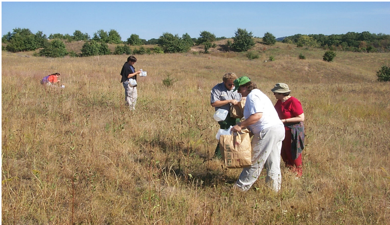
Figure 4. Researchers harvest seed on Nature Conservancy land. The seed was used to plant more sand prairie in Kellogg, Minnesota.

This project resulted from the need to transfer 1.3 million yd 3 of dredged materials from a temporary placement site within the Mississippi River floodplain to a permanent location. The St. Paul District acquired the 150-acre former agricultural field in the early 1990s and allowed the land to go fallow. Plant inventories conducted on the project site in the fall of 2002 and spring of 2003 identified more than 50 native sand prairie species that established naturally when the site was allowed to go fallow. It was decided to strip the topsoil containing this seed bank and use the soil as containment berms during the hydraulic placement of dredged material. Following construction of the sand dunes, stockpiled topsoil was spread back onto the site. Concurrent with this, the District partnered with The Nature Conservancy to mechanically harvest seeds from their lands as well as hand-collect seed using volunteers (Figure 4). First, a total of 32 species of local ecotype seed was acquired for the project. A contractor planted 47 species, and an additional 13 species were hand-planted by volunteers, for a total of 60 species. The contractor will monitor the site for four growing seasons and control weed species as necessary.